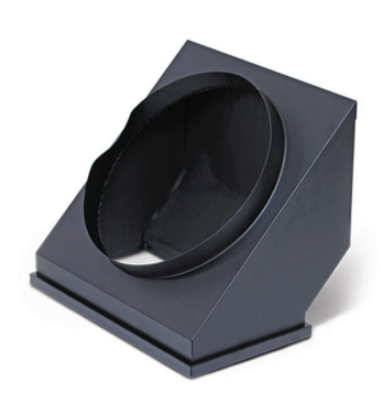
Discharge Duct Adapter For extended duct length Part Number: 2DDA-16