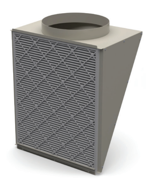
Condenser Return Air Plenum For installations where it is required to duct air to the inlet of the condenser. Part Number: DCP-5