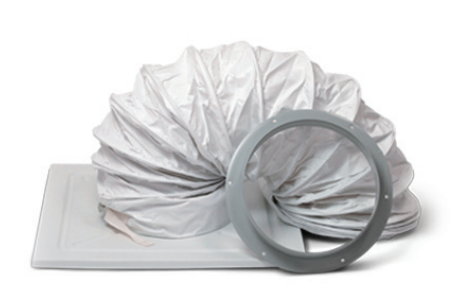
Ceiling Panel Kit For discharging the condenser air above a drop ceiling Part Number: CK-16