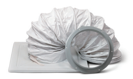
Ceiling Panel Kit For discharging the condenser air above a drop ceiling Part Number: CK-16