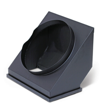
Discharge Duct Adapter For extended duct length Part Number: 2DDA-16

Condenser Return Air Plenum For installations where it is required to duct air to the inlet of the condenser.