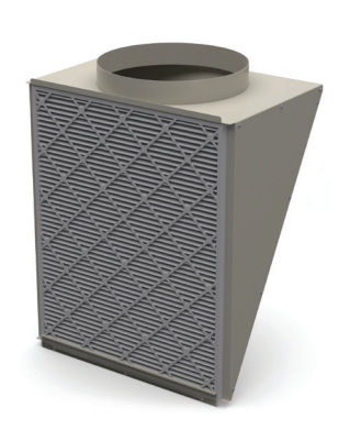
OCEANAIRE PROVIDING A BETTER CLIMATE ANYWHERE.

OceanAire, Inc. 1731 Wall Street, Suite 100 Mount Prospect, Illinois 60056