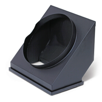
Discharge Duct Adapter

For ducting return air Part Number: DEP-16