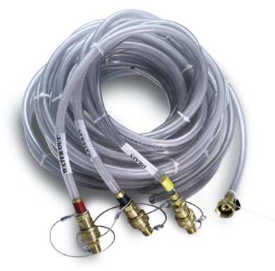
Quick-Connect Hose Kit / 40 Foot

Part Number: HK-6QC Designed for use with OceanAire portable water-cooled air conditioners equipped with quick-connect fittings.