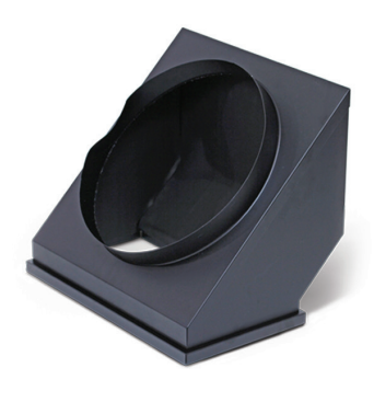
Discharge Duct Adapter

Part Number: HA-LGQC Quick connect transition to garden hose connection