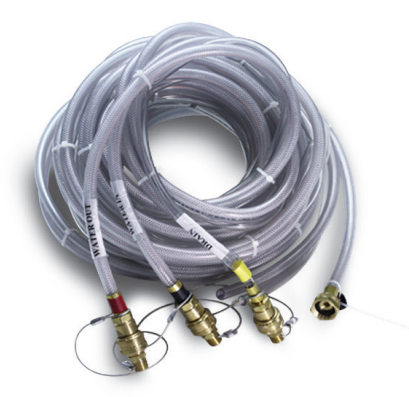
Quick-Connect Hose Kit / 40 Foot

Part Number: HK-5QC Designed for use with OceanAire portable water-cooled air conditioners equipped with quick-connect fittings.