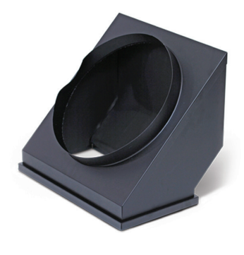
Discharge Duct Adapter

Part Number: HA-SMQC Quick connect transition to garden hose connection