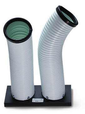
Nozzle Kit / 2 x 6"

For ducting return air Part Number: 2DEP-12