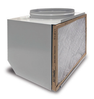
OCEANAIRE PROVIDING A BETTER CLIMATE ANYWHERE.