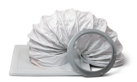
Ceiling Panel Kit For discharging the condenser air above a drop ceiling Part Number: CK-16