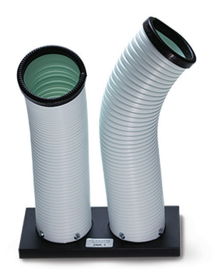
Nozzle Kit / 2 x 6 " For directional cooling Part Number: 2NK-2