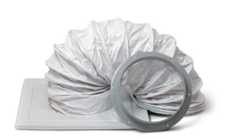
Ceiling Panel Kit For discharging the condenser air above a drop ceiling Part Number: CK-12