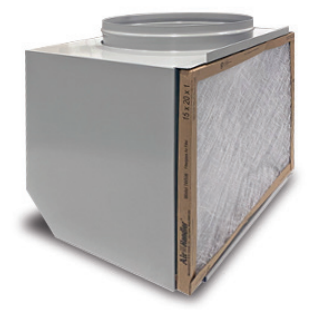
Condenser Return Air Plenum For installations where it is required to duct air to the inlet of the condenser. Part Number: 2DCP-2