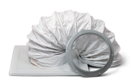
Ceiling Panel Kit For discharging the condenser air above a drop ceiling Part Number: CK-12