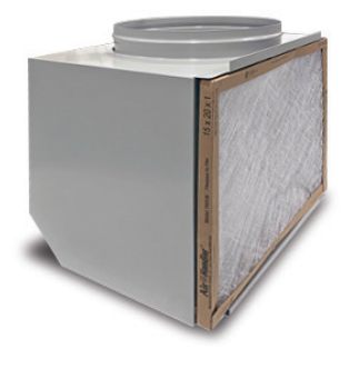
Condenser Return Air Plenum For installations where it is required to duct air to the inlet of the condenser. Part Number: 2DCP-2