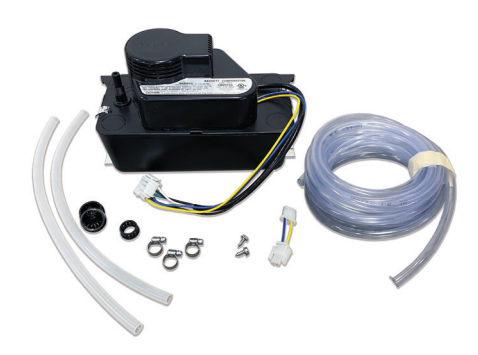
Universal Condensate Pump Kit For unattended operation Part Number: UPK-115